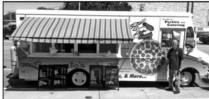
Mr. Sorrento's On Wheels Available For Parties & Catering

Mr. Sorrento's Offers Limited Delivery... ... to all Hershey area businesses, including Hershey Med Center and all Hershey Company campuses during lunch hours only... 11am to 2pm. $20 Minimum Order; Please call (717) 534-1660