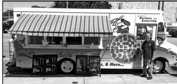
Mr. Sorrento's On Wheels Available For Parties & Catering

Mr. Sorrento's Offers Limited Delivery... ... to all Hershey area businesses, including Hershey Med Center and all Hershey Company campuses during lunch hours only... 11am to 2pm. $20 Minimum Order; Please call (717) 534-1660